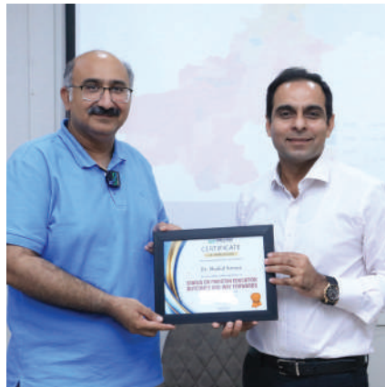
DG PIE Attended session at Qasim Ali Shah Foundation.