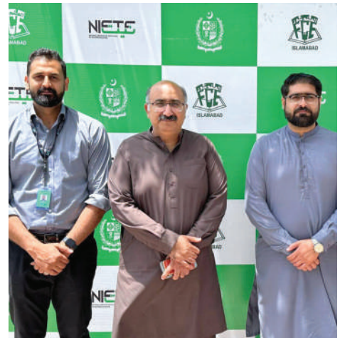
DG PIE Visited NIETE for Future Collaboration.