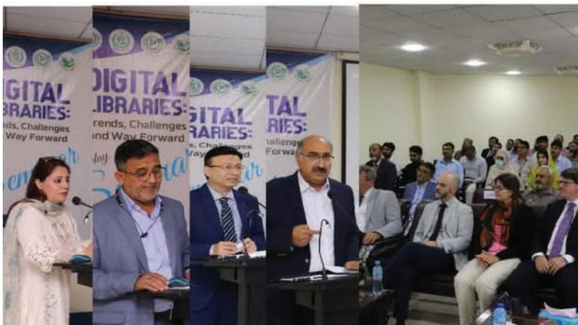
DG PIE presenting in PASTIC.